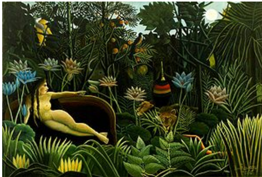
(Fig. 1) Henri Rousseau, "Le Reve" (The Dream), 1910

Rousseau's paintings stage the female figure as secondary to the jungle. Both paintings depict the women as out of place in the wild environment. In "Le Reve" ("The Dream," Fig. 1), the nude woman reclines seductively on a cabriole sofa, which has been oddly placed in the middle of the forest. In "Femme se Promenant dans une Foret Exotique" ("Woman Walking in an Exotic Forest," Fig. 2), the leaves and grass in the painting obstruct parts of the impeccably dressed woman's face and feet, consuming her in the foliage. Plant life in Rousseau's work is often the controlling force and power.