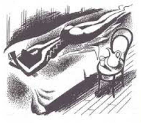
Figure 8: Hurston’s illustration of her initiation ritual from Mules and Men (190)

Common elements of voodoo rituals, nudity and deprivation presumably present a pure body, cleansed to receive or release the spirits within (Fig. 8). Here again, Hurston is silent on the “answers” she receives from her spirit’s journey to “wherever spirits must go,” this time perhaps to uphold the code of secrecy that is imperative to voodoo practitioners. If the secrets must “never be given to men as men,” readers must assume that voodoo experience is not something that can be written or spoken between humans, but rather that its knowledge is only acquirable through initiation, through the vulnerability of the secure, contained self. It is only by putting the body and self up for occupation that one can begin to unlock the secrets of the voodoo universe.