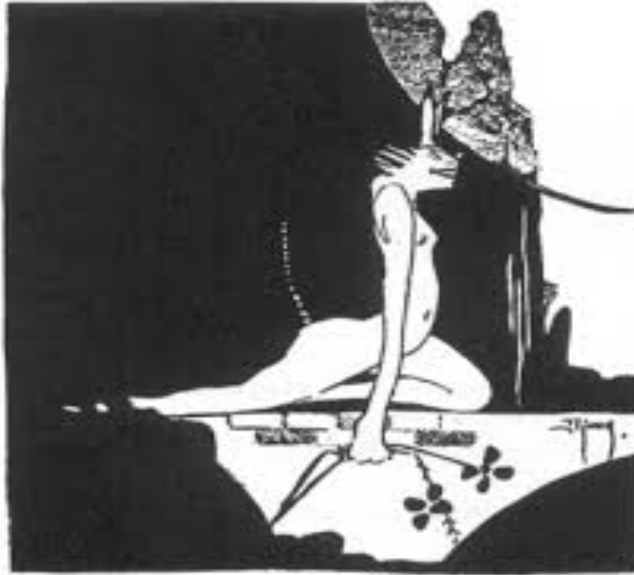
Figure 3, Title unknown, 1915

Bonnie Kime Scott is one of just a few critics who have written about Barnes' illustrations. For Scott, this image in particular is where "the animal and the human merge most memorably" (Kime Scott 43). Scott writes that it anticipates Robin Vote's character in Nightwood , who Barnes describes as a "beast turning human" (Barnes, Nightwood 37). Indeed, this illustration clearly merges animal traits with the human, and contributes to the overall bestial nature of poems contained within The Book of Repulsive Women . But the woman's clutching of the flowers which reach below the horizontal plane also is an effort to figuratively root herself in the earth. Her arm, which disrupts the plane separating her, human above, from the vegetative life beneath her, transgresses the division between the two realms. The tautness of the flowers' lower stems confirms the intensity with which she holds on to her connection to the earth; these appear to be still rooted, as if the figure holds onto them for stability or support. There is a dark amorphous figure at the bottom of the frame, perhaps a rocky landscape that is mirrored in the dark craggy shapes above ground.