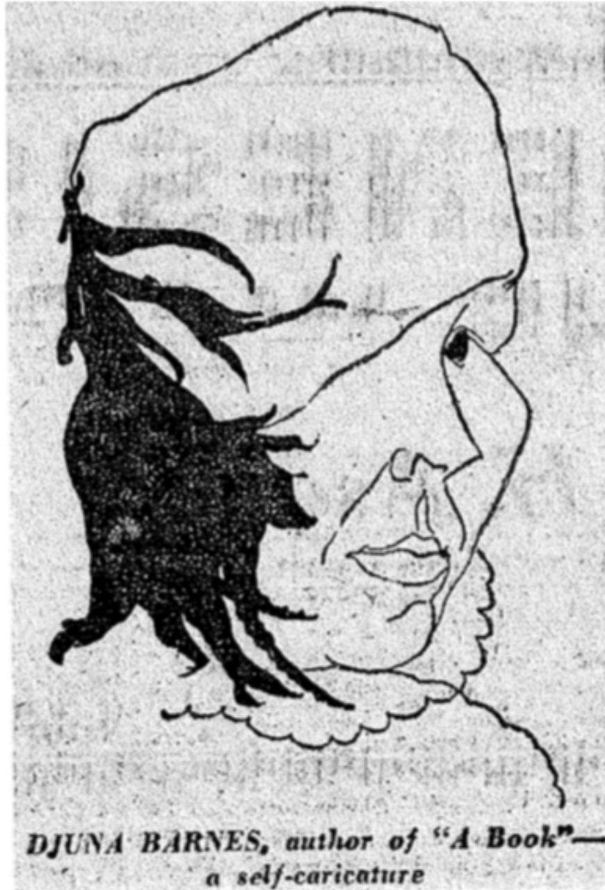
Fig. 5: Wallace and Elliott, Women Artists , p. 40. The drawing has the caption: 'Djuna Barnes, author of A Book – a self caricature'. Undated. Series VIII, Box 8, Folder 1, Item 4.25.