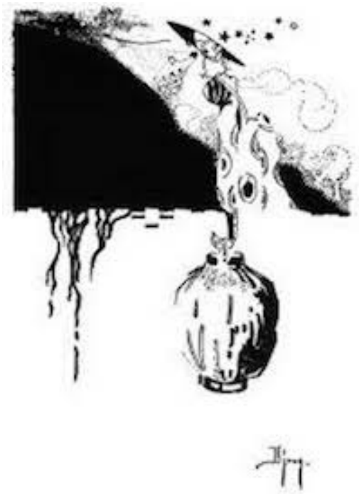
Fig. 4, Title Unknown, 1915

In the other example I've included (Fig. 4), a similar kind of division and transgression is depicted: