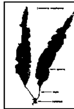
Fig. 6 (left) and Fig. 7 (right) of Brown Algae, open access online